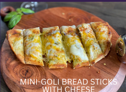
MINI-GOLI BREAD STICKS WITH CHEESE