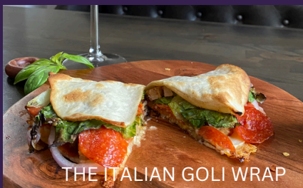
THE ITALIAN GOLI WRAP